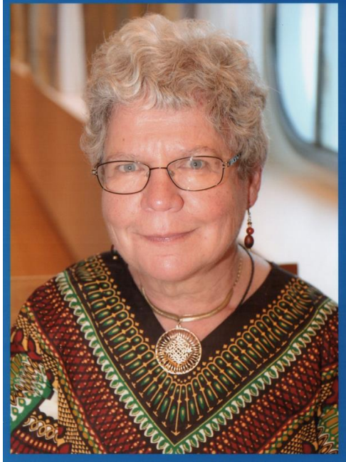
Roella filled a Casual Vacancy