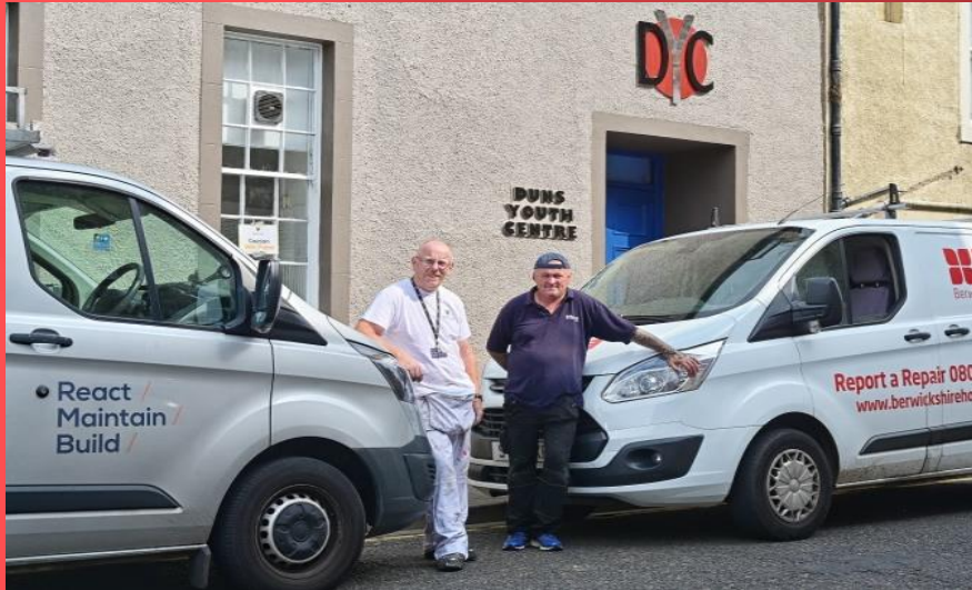
Duns Youth Centre