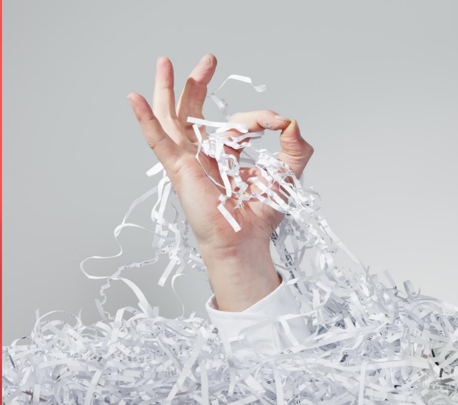
Going Paper Free