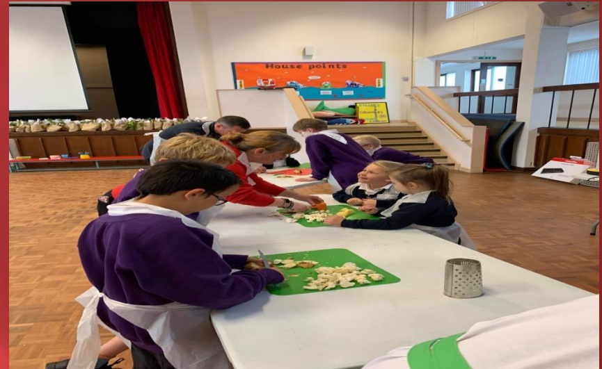
Souptastic Event in Eyemouth