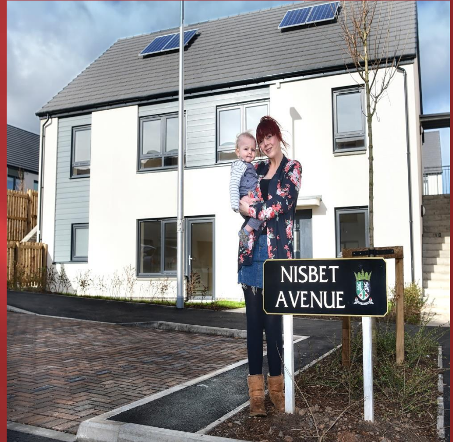
Spending more time with our tenants