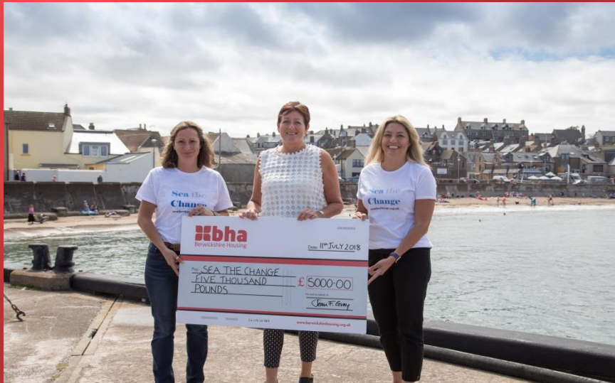
Sea The Change